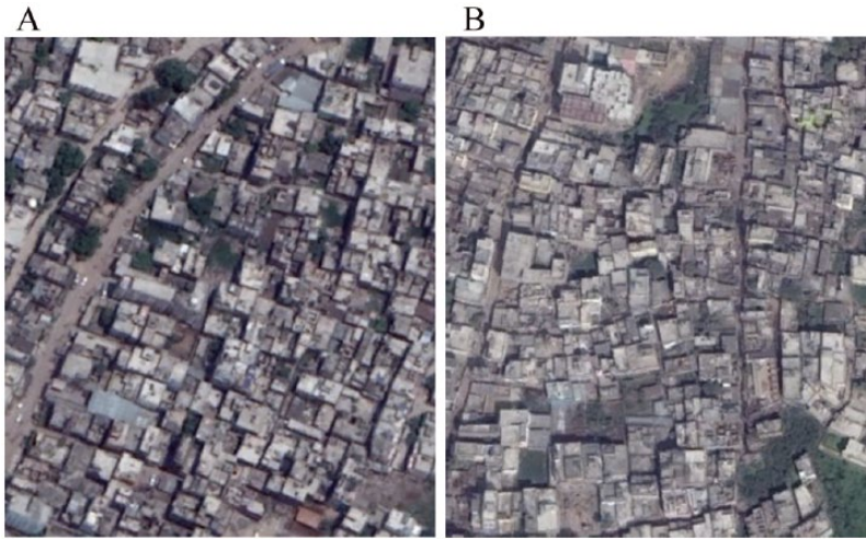
FIGURE 3 Satellite images of Patna slums