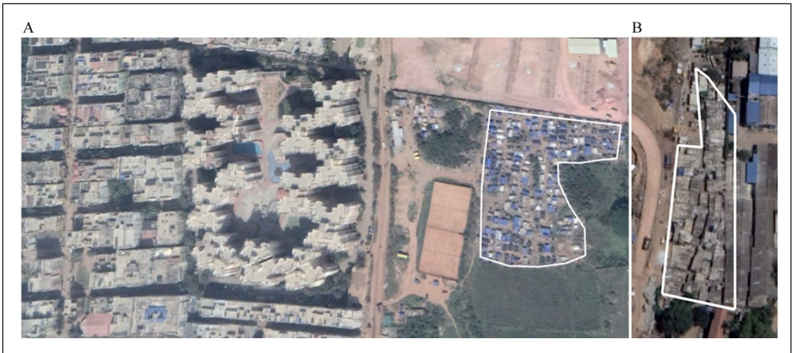
FIGURE 1 Satellite images of non-slum areas and slum areas: 2018