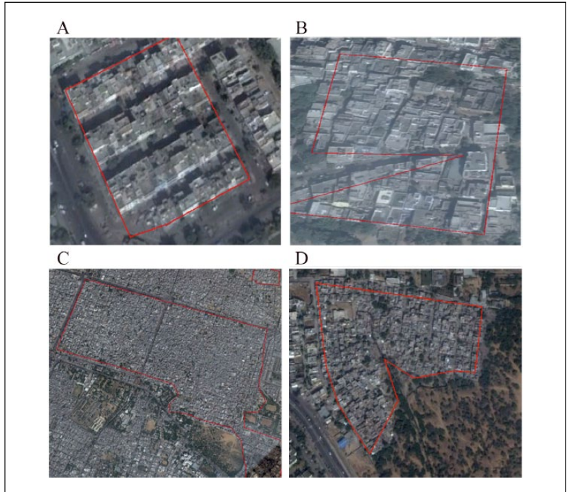
FIGURE 2 Examples of images of Jaipur satellite types

29. We have recently begun looking at higher-resolution images, including through a collaboration with an urban geographer and a computer scientist.